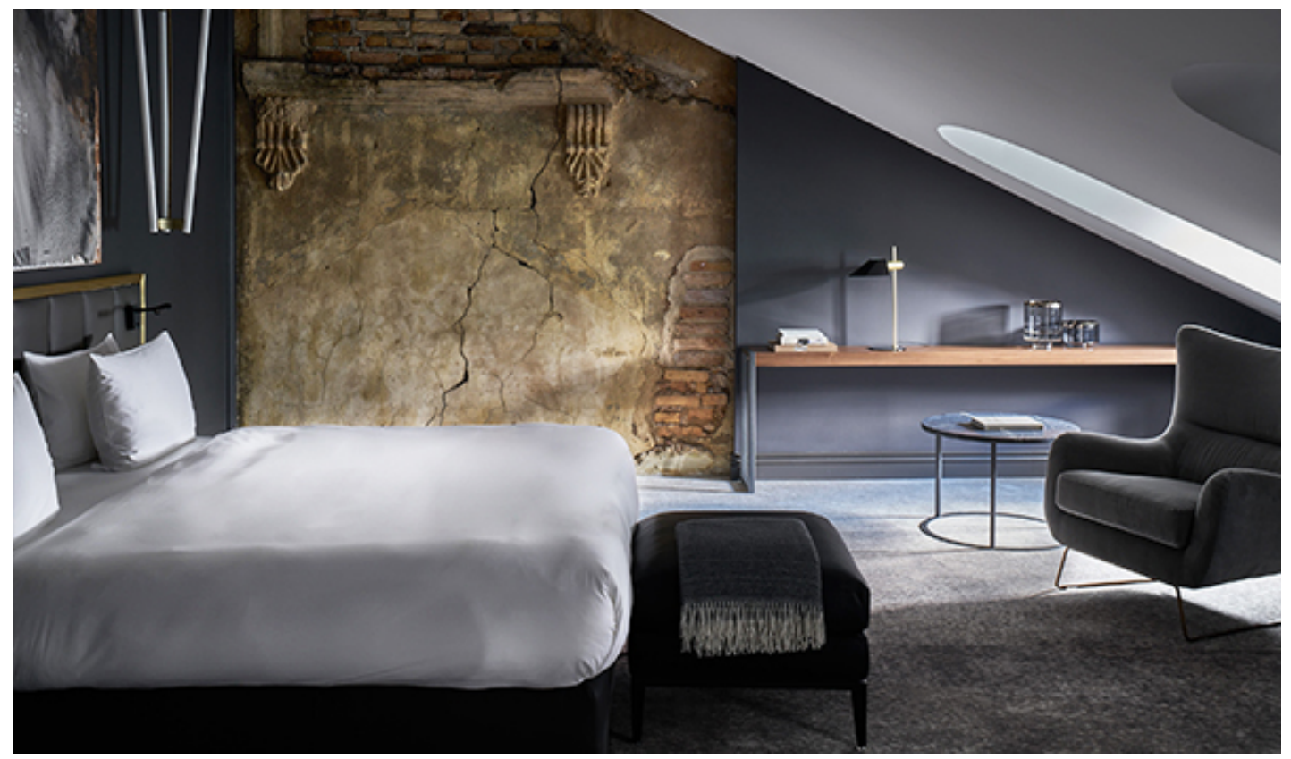
Hotel Pacai Opens in Vilnius, Lithuania Design Hotels<sup>TM</sup> welcomes its first Baltic member hotel

Berlin, May 31, 2018— Now open in the vibrant Old Town of Vilnius, Lithuania, Hotel Pacai and its 104 guestrooms are ready to welcome the world to this incredibly vibrant destination of the southern Baltic. As the passion project of a team of local architects and designers, Hotel Pacai showcases deep ties to this fascinating country. Here, on the main artery of the medieval Old Town, the striking classicist facade houses a melding of historical artifacts and contemporary design. Part grand hotel in service, and part hip cultural hub in spirit, Hotel Pacai's complete in-house experience is not only a celebration of the treasured past of the building, but also a model example of how cultural engagement shines a light on the local community of this place. <a href="www.designhotels.com/hotel-pacai">www.designhotels.com/hotel-pacai</a>