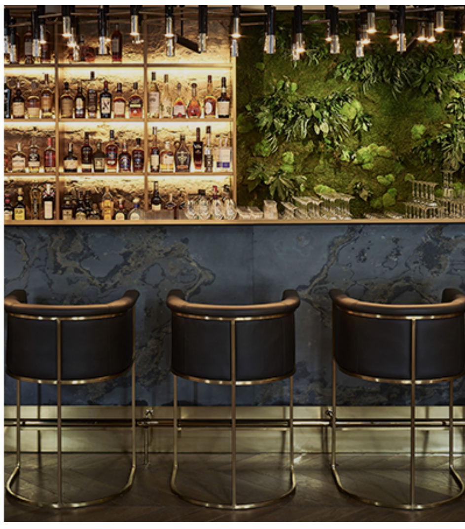
Notes to Editors

For high resolution images and more information on our member hotels, please register on the Design Hotels<sup>TM</sup> Virtual Press Office <u>designhotels.com/press.</u>