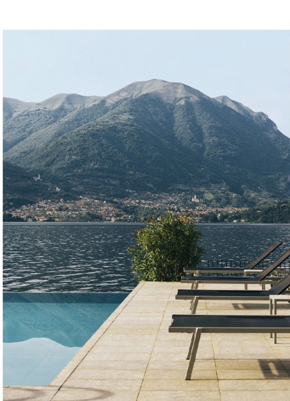
Filario Hotel & Residencies

At Finolhu Baa Atoll Maldives , 125 luxurious villas are set directly on the beach or on stilts above the UNESCO-protected lagoon. The Baa Atoll is one of the largest in the Maldives and is home to over 105 coral reefs and 1,200 different species of marine life. Beyond the water, the hotel's Fehi Spa treatments are crafted in tune with the local climate and include body wraps, peels, ritual applications, and a range of massages. At The Library in Chaweng Beach on Koh Samui, Thailand's second largest island, a palm-fringed beach is accompanied by nearby coconut groves and mountainous rainforest. The minimalist resort provides ample space to read, roam, and reflect. It boasts a signature red pool—a hue given off by its orange, yellow, and red tiling—backdropped by soft waves breaking on the shore as well as a library with a curated collection of over 1,400 books.