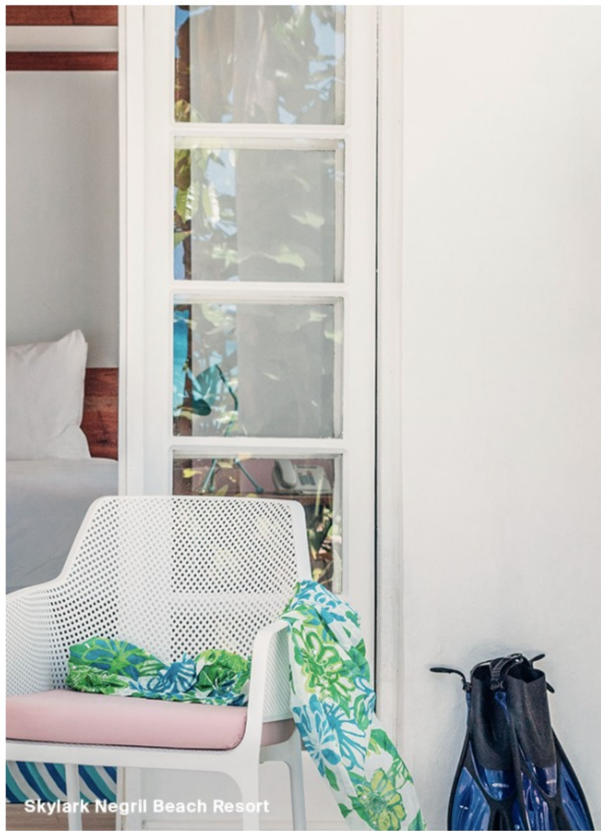
Skylark Negril Beach Resort

As the days grow shorter in the northern hemisphere, beaches with extended daylight hours and idyllic sunsets offer beacons of light, both metaphorically and literally. This collection of eight properties features an array of tropical escapes and more temperate seaside getaways—from the Caribbean, Atlantic, and Pacific coastlines, to the Indian Ocean and Gulf of Thailand.