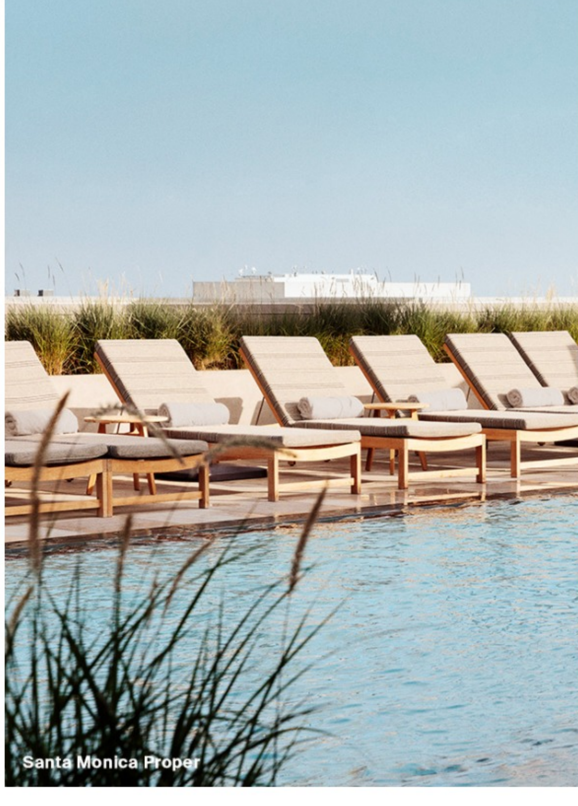
Santa Monica Proper

Aurea in Tola, Rivas, is situated next to the Pacific Ocean, directly along Nicaragua's Emerald Coast, a 30-mile stretch of unspoiled coastline and dry tropical forest. The property seamlessly connects indoors and outdoors through wide glass enclosures, and the area boasts world-class surfing as well as sunset horseback rides on the shore. Further north, Santa Monica Proper Hotel in California is home to the only rooftop pool deck on the city's Westside and offers unparalleled views of the Pacific. The beach, famous Santa Monica pier, and an abundance of health-conscious and fine dining options are within walking distance, and the city itself is known as the place "where L.A. goes to swim."