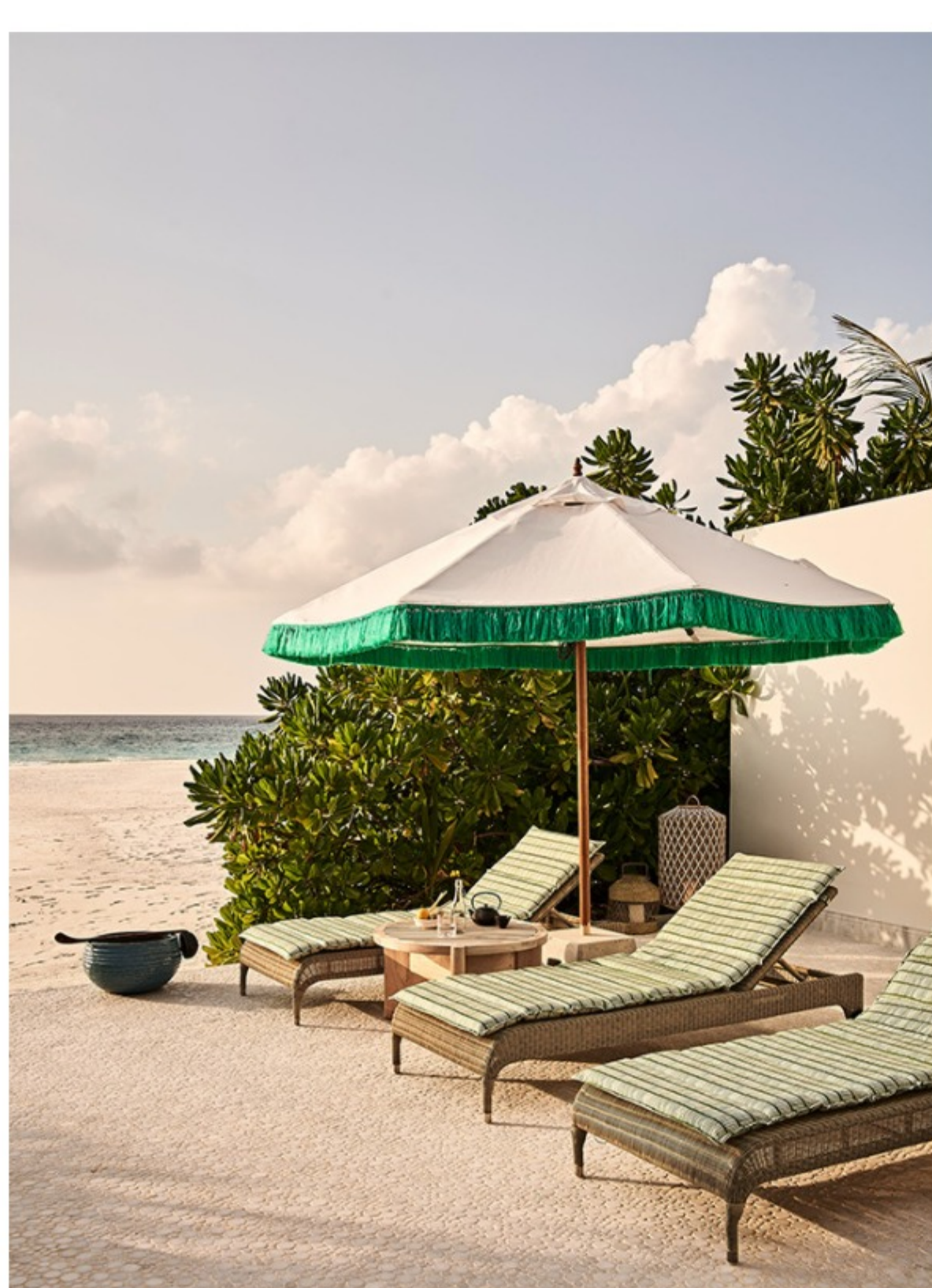
Finolhu Baa Atoll Maldives

Aurea in Tola, Rivas, is situated next to the Pacific Ocean, directly along Nicaragua's Emerald Coast, a 30-mile stretch of unspoiled coastline and dry tropical forest. The property seamlessly connects indoors and outdoors through wide glass enclosures, and the area boasts world-class surfing as well as sunset horseback rides on the shore. Further north, Santa Monica Proper Hotel in California is home to the only rooftop pool deck on the city's Westside and offers unparalleled views of the Pacific. The beach, famous Santa Monica pier, and an abundance of health-conscious and fine dining options are within walking distance, and the city itself is known as the place "where L.A. goes to swim."